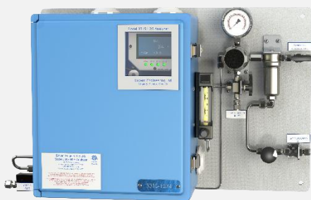
331S H 2 S Analyzer with Standard Sampling System