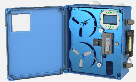
Envent Model 331S H 2 S Analyzer