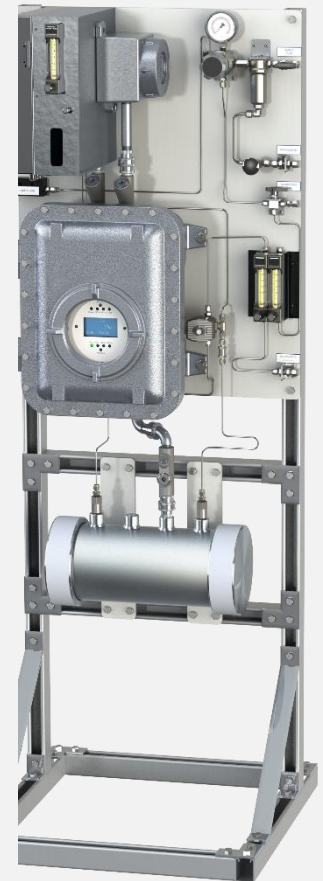
Envent Model 330S with Standard Sample Conditioning and Total Sulfur Oven