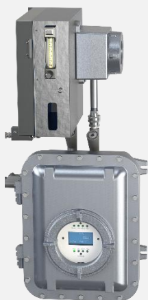
Envent Model 330S Analyzer