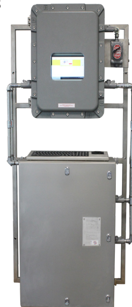
Model: M41022 - ATEX - 21 - Exd

Impurities detection in Natural Gas / LPG / Propane / Butane Deodorisation control ppb Propellant gas Catalyzer protection Natural gas or LPG odorisation control ppm