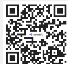
Envent Gas Chromatograph Software (GCS)