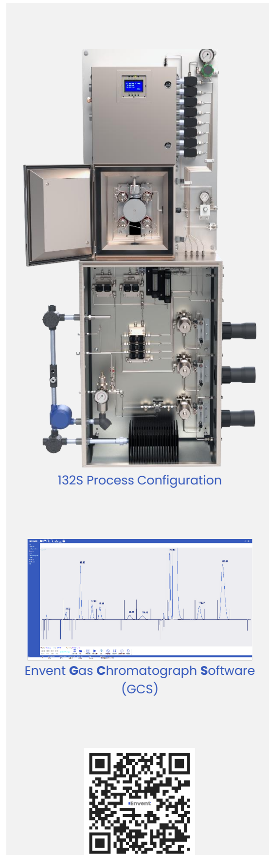
132S Process Configuration