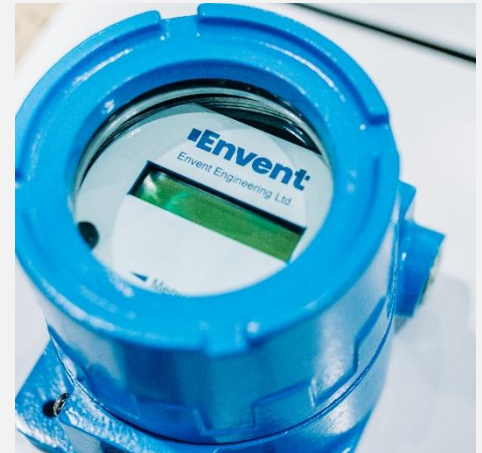
Envent M-Series housing