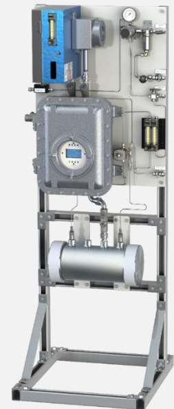
Envent Model 330S-EX with Standard Sample Conditioning and Total Sulfur Oven