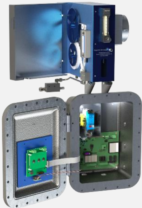
Envent Model 330S-EX Analyzer