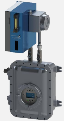
Envent Model 330S-EX H 2 S Analyzer