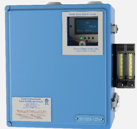
Envent Model 331SDS H 2 S Analyzer