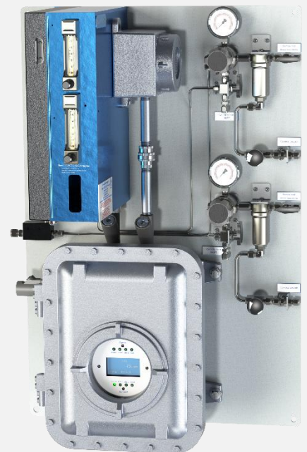
Envent Model 330SDS with Standard Sample Conditioning