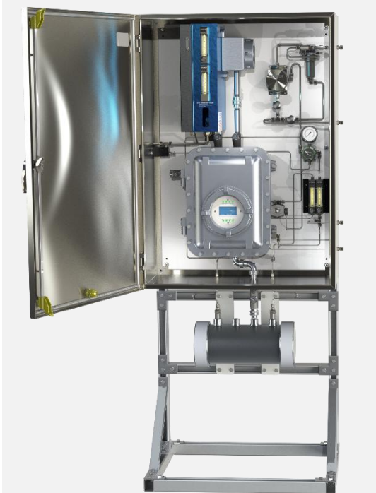
331SDS H 2 S and Total Sulfur Analyzer with Auto-Calibration in Stainless Steel Enclosure