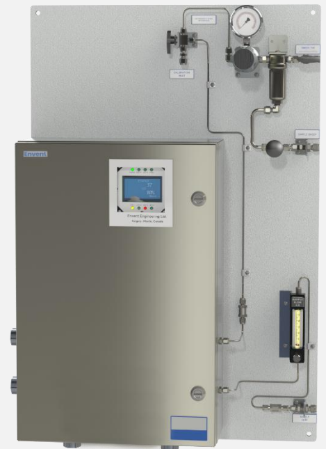
TFS2 with Standard Sample Conditioning System