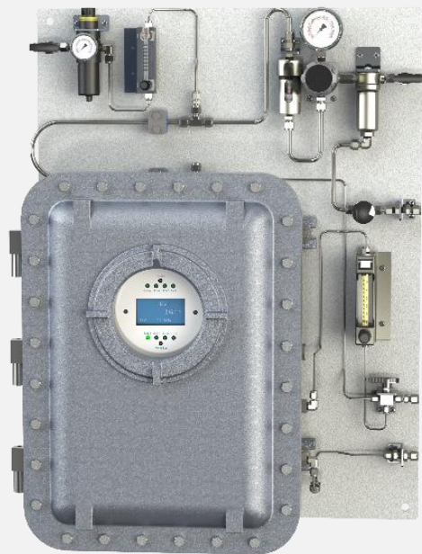
TFS1 with Sample Conditioning System for Saturated & Dirty Gas