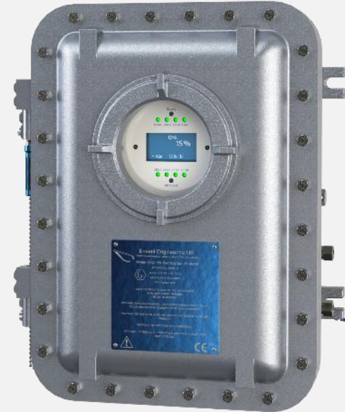
Envent Model TFS1